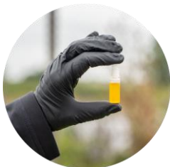
Single Use Test