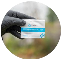
Nuclear Detection wipe